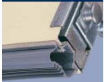
The Cedar Colorgrain

Below: Extruded Aluminium Bottom Rail adds strength to the Panel-Glide® . Incorporating strong durable weatherseal that will assist in preventing undesirable material entering the garage.