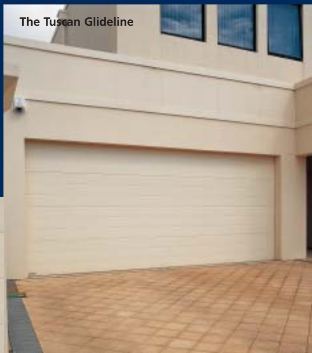
The Tuscan Glideline

Above: Fully Tubed Hinges ensure smooth operation and are corrosion resistant. Incorporating nylon self lubricating rollers the hinges will provide years of reliable service.