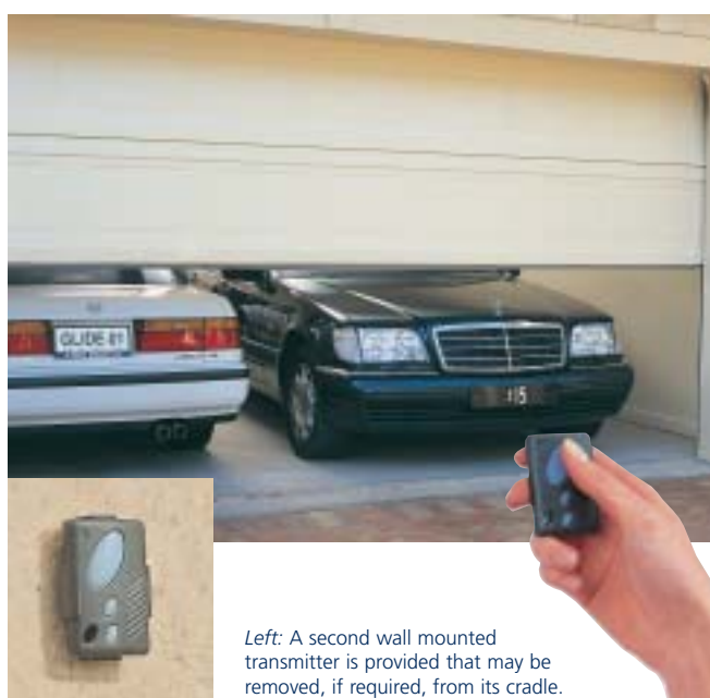
Left: A second wall mounted transmitter is provided that may be removed, if required, from its cradle.

GTS Transmitter The state of the art 3 button mini transmitter can operate up to 3 doors or 2 doors and a gate or home alarm system setting. The UHF transmitter is generally line of sight operation, which is highly recommended for your personal safety. An additional feature of the handset is the facility to use the handset to set the up and down door limits.